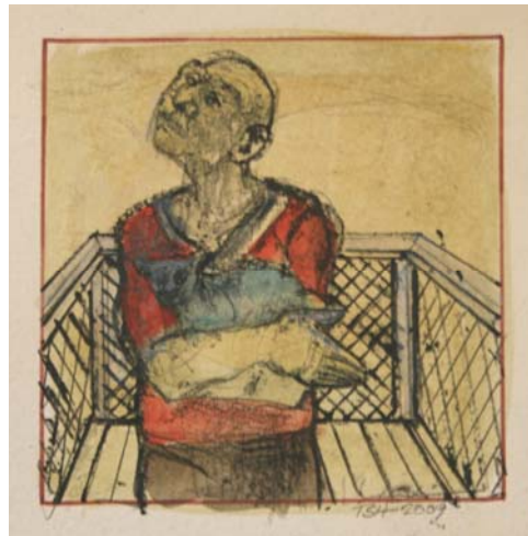
Untitled – Tom Humes

First Floor: Kyohei Abe: Minimal Landscapes – Photographs of minimal, imaginary landscapes by an accomplished photographer with a background in architecture.